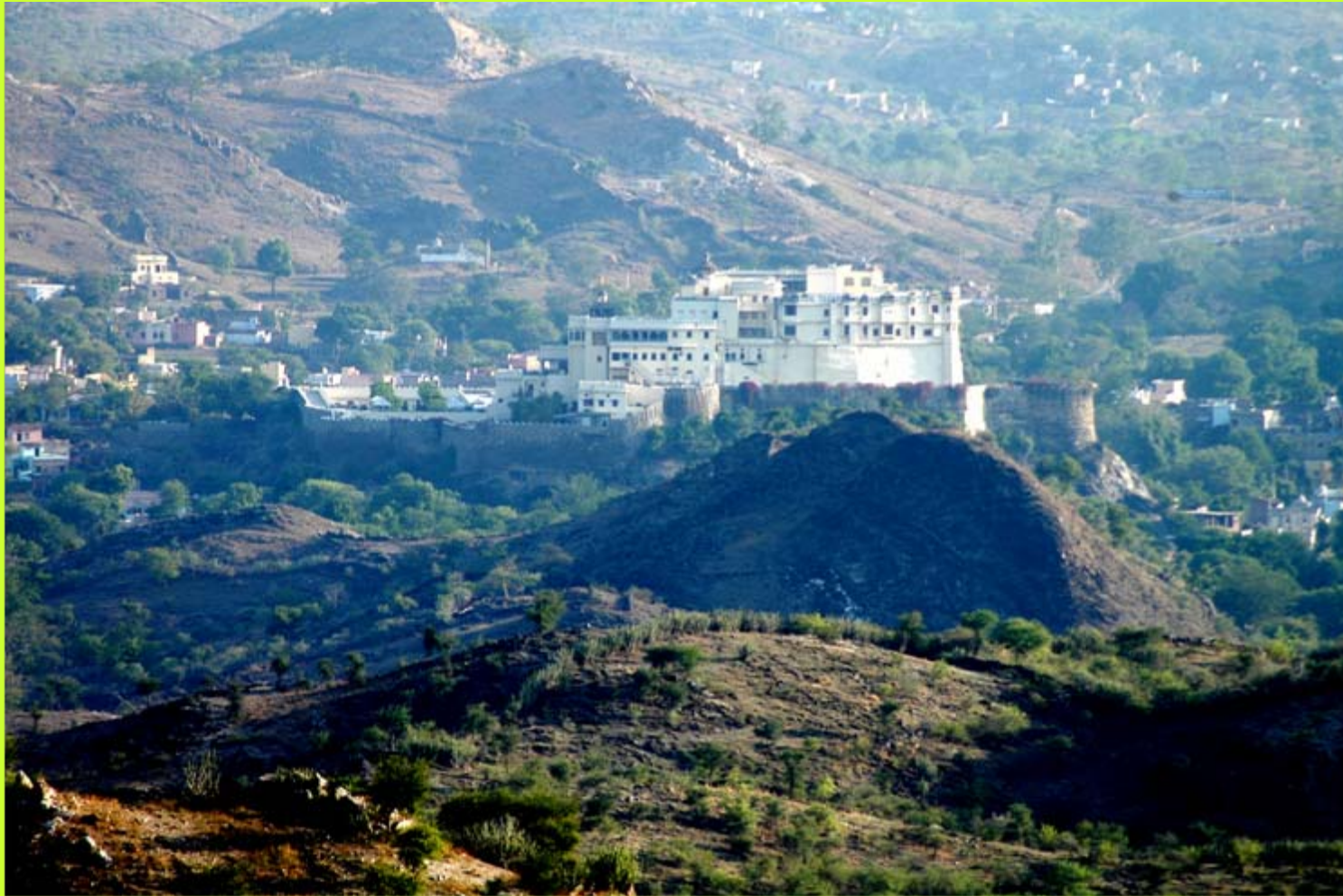
View of the Devi Garh Fort Hotel